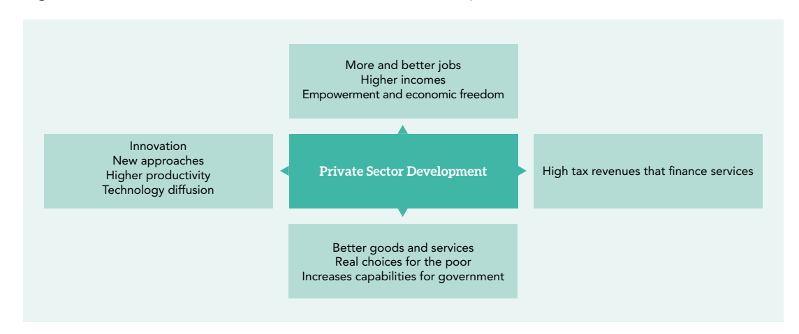
Figure 1 Potential contributions of Private Sector Development (DFID 2008)

According to Mac Sweeney (2008), "Private Sector Development aims to achieve a vibrant and accessible market system, which encourages broad-based and inclusive economic growth".<sup>19</sup> The Australian House of Commons (2012) states that: "The overall role of the private sector in development, in terms of both local private sector activity and foreign investment, is to generate wealth and stimulate economic growth. The private sector does so by creating jobs, mobilising resources, introducing creativity and innovative solutions, and fostering skills development and training. At the same time, it is acknowledged that the private sector should not be viewed as a panacea that can solve all development challenges, or that one approach works in all countries and contexts".<sup>20</sup> Figure 1 shows the main areas where private sector development can make a positive contribution to development.