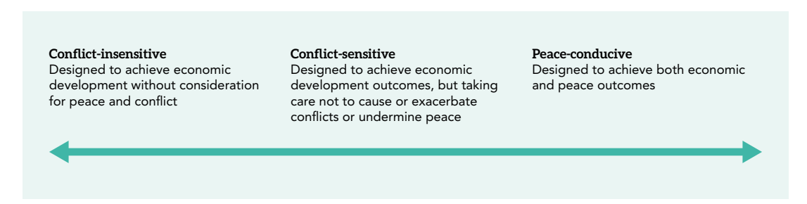
Figure 2 The conflict-sensitivity continuum – from interventions that pay no attention at all to conflict and peace issues on the left to interventions designed to make a positive contribution on the right (International Alert, 2015)<sup>41</sup>

Although there is no general agreement on a precise definition of peacebuilding, according to the OECD (2012), peacebuilding implies going beyond the "transition from war to peace" by "supporting sustainable peace, regardless of whether or not political conflicts have recently produced violence". <sup>42</sup> Many academics and NGOs are proponents of the potential role of the private sector in peacebuilding. To reach the SDGs, an important role is assigned to the private sector, including to SDG 16, which calls for the promotion of peaceful, just and inclusive societies. <sup>43</sup>