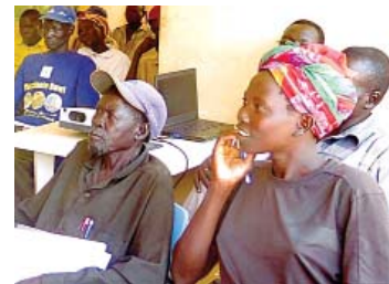
A COMMUNITY PEACE COMMITTEE MEETING IN KIDEPO VALLEY IN THE EASTERN EQUATORIAN REGION OF SOUTH SUDAN IN DECEMBER 2017.

“Those in peace committees are primarily driven by the desire to bring peace to their communities.”