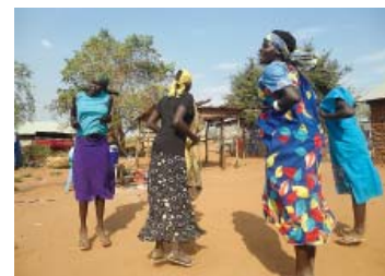
MUNDARI WOMEN DANCING IN THE OUTSKIRTS OF JUBA, SOUTH SUDAN.

“ In Ikotos, signs of peace among communities include youth dancing throughout the night, drinking from one calabash, and lorries carrying goods on the road. ”