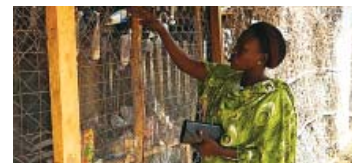
DCA'S SUPPORT OF VSLAs IN KAPOETA, SOUTH SUDAN, EMPOWERS WOMEN TO START BUSINESSES AND GENERATE INCOME FOR THEMSELVES AND THEIR FAMILIES.

“As of December 2017, DCA had established 15 village savings and loan association (VSLA) groups with 369 members, comprising 194 women and 175 men in Kapoeta South and Budi (Kapoeta state) and Bor South.”