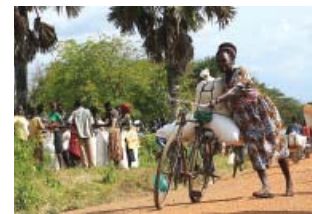
A REFUGEE FROM SOUTH SUDAN TRANSPORTS FOOD FOR DISTRIBUTION IN THE MOYO DISTRICT, NORTHERN UGANDA, IN OCTOBER 2017.

“The country remains the fastest-growing and largest refugee situation in Africa, with an estimated 3.1 million South Sudanese refugees projected to be hosted by six neighbouring countries by the end of 2018.”